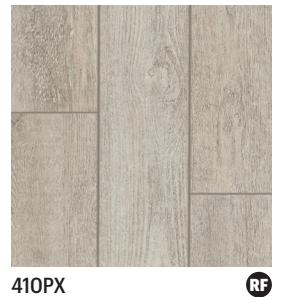
410PX Seaside Overlook Sandy Taupe