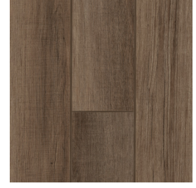
413PX Whispered Secret Milk Chocolate

415PX Trailhead Point National Park Brown