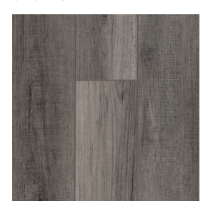
412PX Wolf Point Hickory Moon Shadow