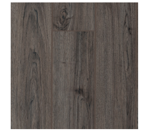
418PX Picture Perfect Dark Brown