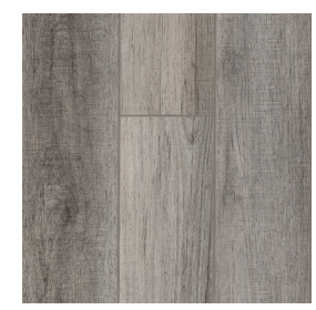
411PX Whispered Secret Subtle Gray