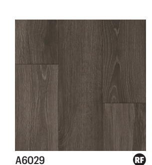
A6029 Treasured Villa Oak Worn Saddle