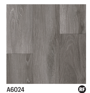
A6024 Treasured Villa Oak Weathered Slate