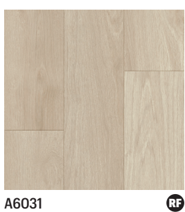
Charmed Bungalow Oak Woven Hemp