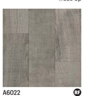
A6022 Northern Lodge Oak Sandstone Walkway