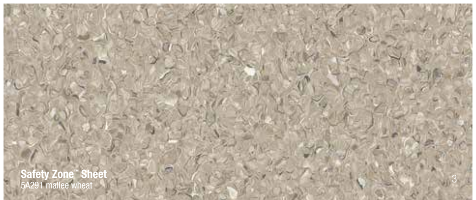
Safety Zone™ Sheet 5A291 mallee wheat