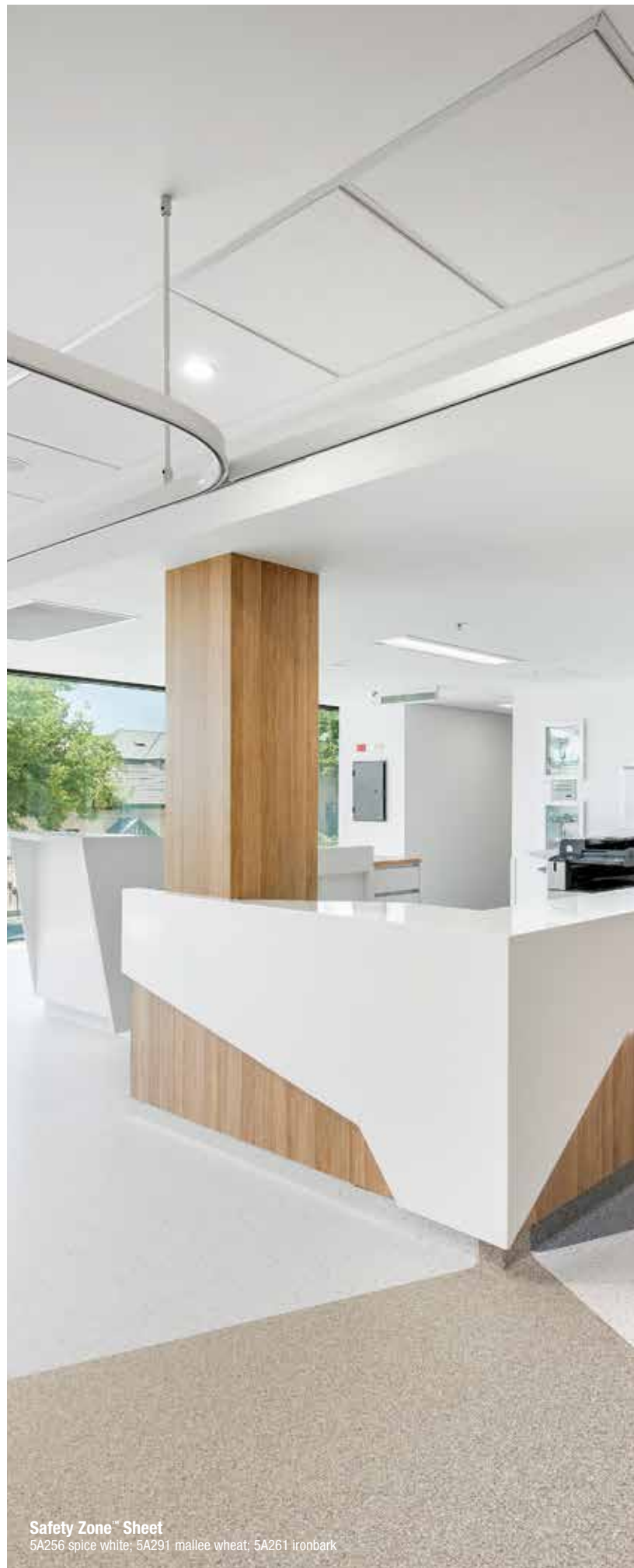
Safety Zone™ Sheet 5A256 spice white; 5A291 mallee wheat; 5A261 ironbark

of overall warranty coverage by using any Strong System™ subfloor preparation product.