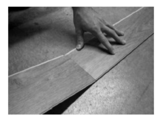
Fig. 3 – Angle end tongue into end groove on planks in the initial row