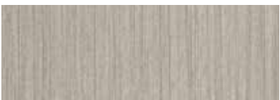
J5261 | J5161 Havana, Biscuit Beige

Jace and Havana are sophisticated fabric designs in subtle neutrals offered in 18 in. x 18 in. tiles.