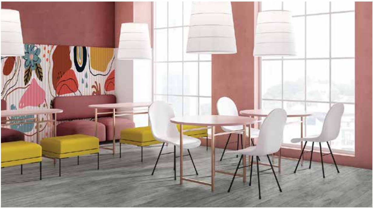
J5216 | J5116 Glendale Oak, Silver Fox