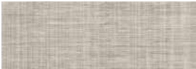
J5251 | J5151 Jace, Pier Beige

The curated collection features sophisticated fabric designs in a tile format, an array of wood species and a stone-inspired wood plank to balance the collection.