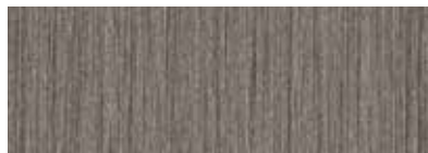
J5263 | J5163 Havana, Henna