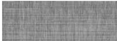
J5250 | J5150 Jace, Silver Gray