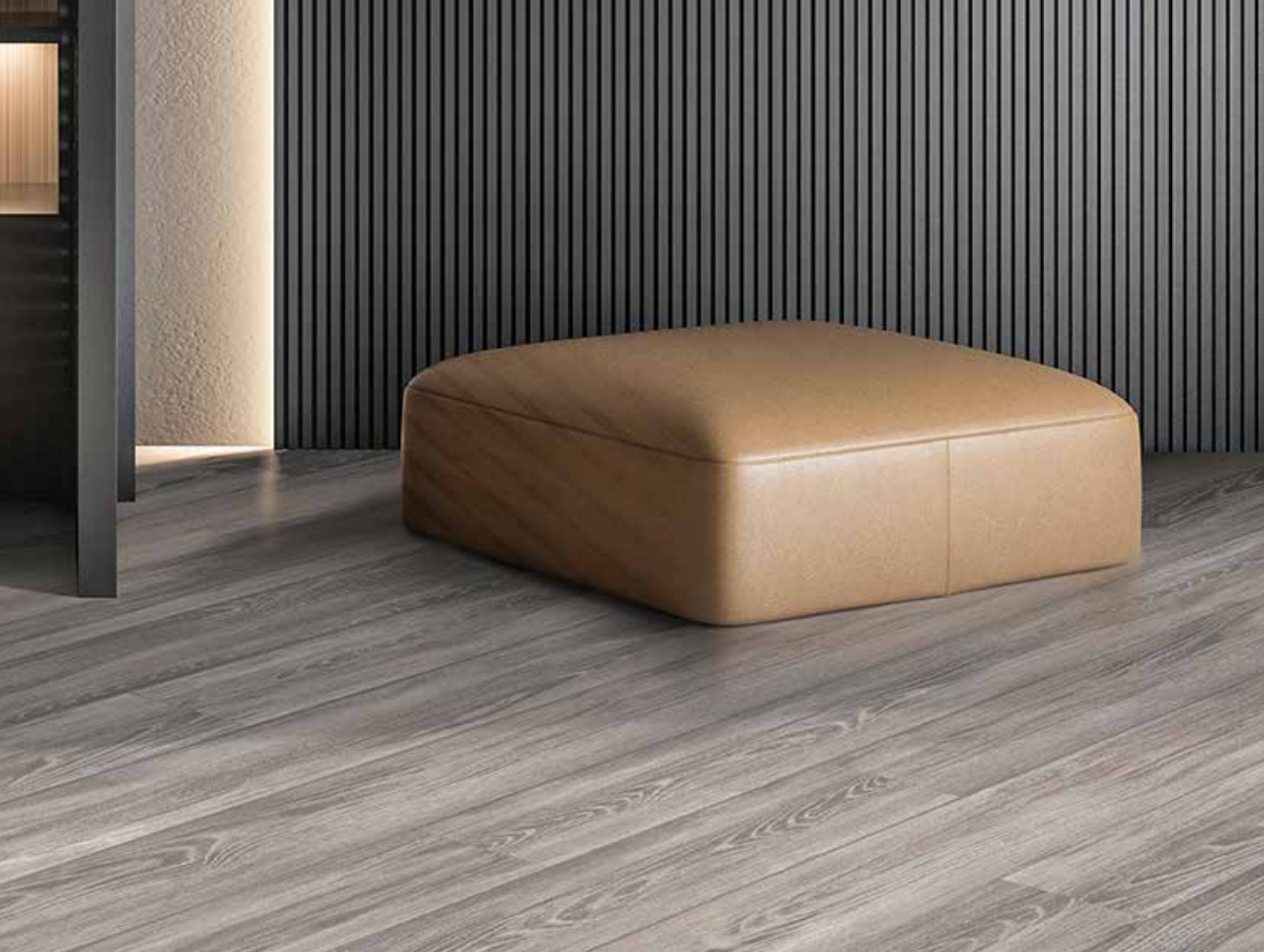
J5255 | J5155 Brushed Essence, Enchanted