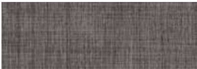
J5252 | J5152 Jace, Ebony Gray